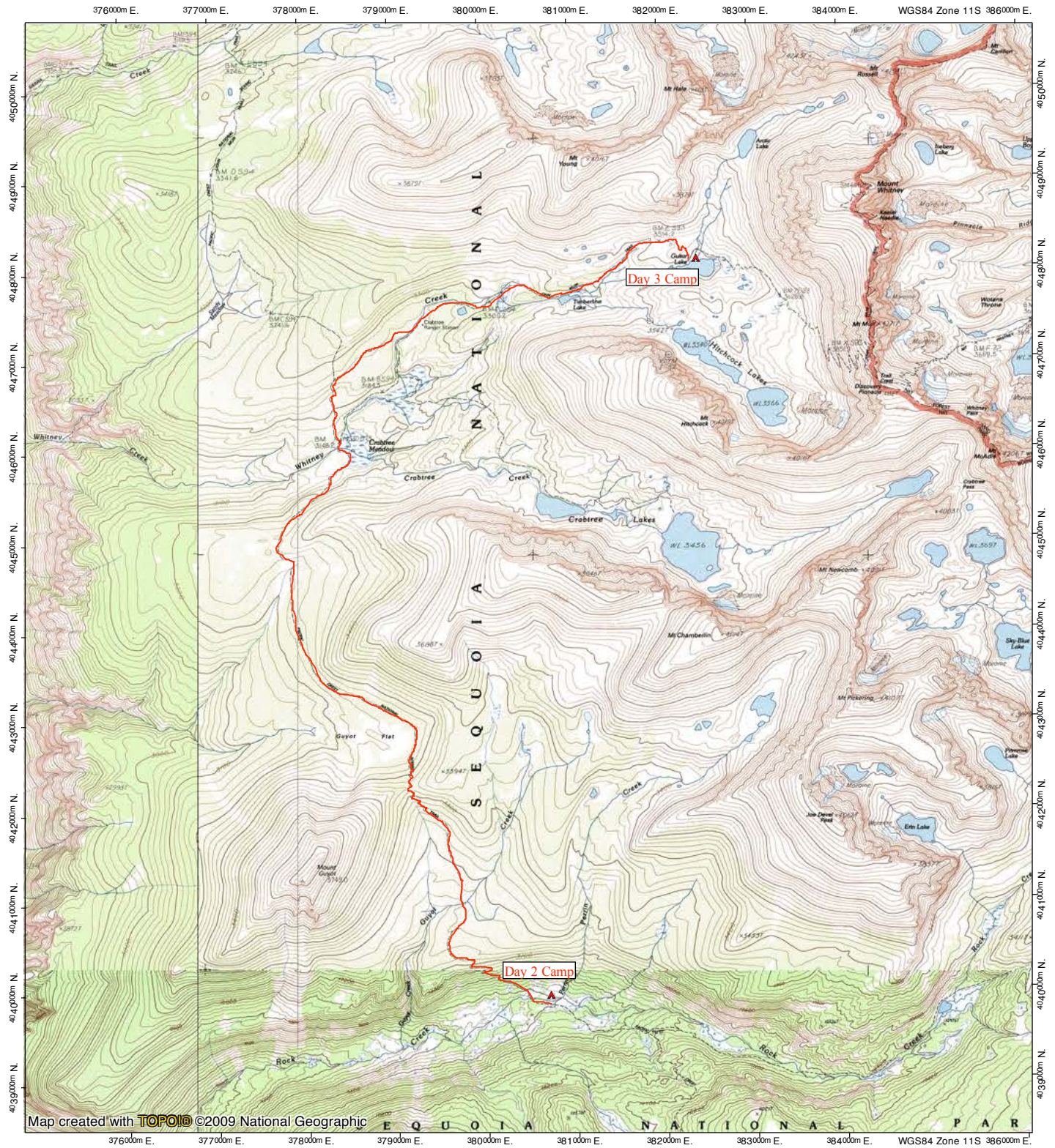
Map created with TOPO! ©2009 National Geographic